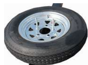
13" spare tire

Load or Wind Guides (set of four) Helps center your pontoon on a windy day or a rough lake. Angled back to help prevent damaging spray fins. Mounts with U bolts onto any cross member.